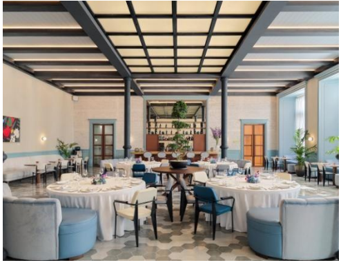
OS ESPELHOS – BANQUET LAYOUT