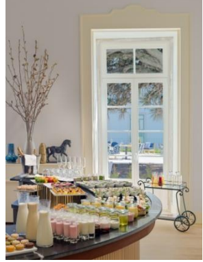
O JARDIM WINE BAR

O Jardim Wine Bar: presided over by an elegant circular bar, O Jardim Wine Bar is located in another grand hall of the palace that has been perfectly restored to recover the original splendor of its coffered ceiling and large windows. It also provides direct access to the palace gardens.